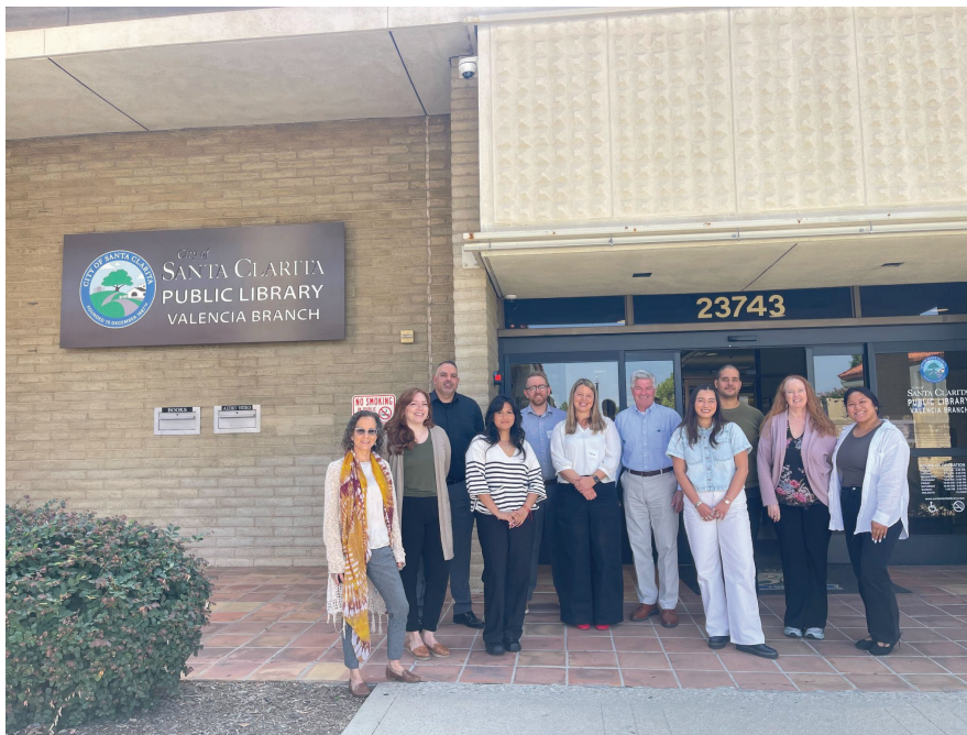
Collaborative meeting 5 in Santa Clarita