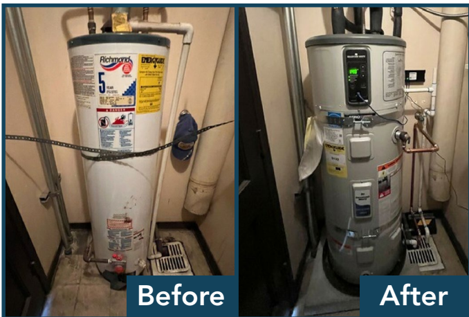
Before and after installation photos of the City of Seal Beach City Hall.