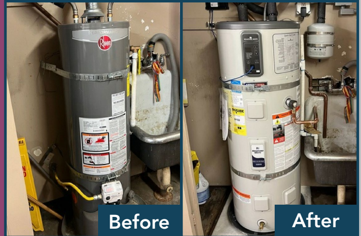
Before and after installation photos at the Marina Community Center in the City of Seal Beach.

In 2023, 18 agencies leveraged SoCalREN's expertise to install heat pump water heaters across multiple facilities. Through incentives provided by SoCalREN, additional TECH Clean California funding, and Water Heater Warehouse procurement, this collaboration brought participating agencies reduced project costs and supported the completion of their respective installations.