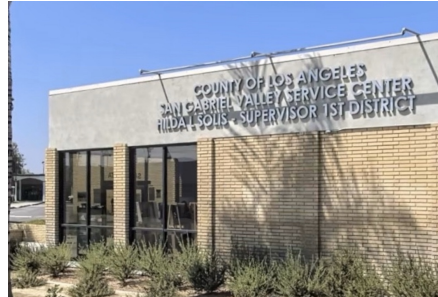
Pictured: Centro Maravilla Service Center (Left), San Gabriel Valley Service Center (Right)

We're starting 2021 off by celebrating a huge success for Los Angeles County. In November 2020, the County completed several energy efficiency upgrades at their Centro Maravilla and San Gabriel Valley Service Centers. These upgrades resulted in over $839,000 in lifetime cost savings! Since the project's inception in November of 2019, we've thoroughly enjoyed working with the County, which leveraged SoCalREN's no-cost services through the Project Delivery Program and Metered Savings Program including comprehensive audits, technical specifications, design review, financial analysis, measurement and verification, and more.