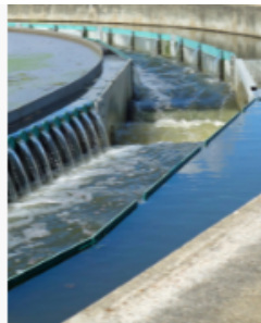
Collection and recycling of wastewater