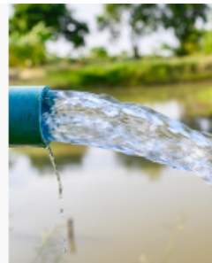
Replenishment of the local groundwater basin