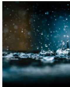
Regional stormwater protection