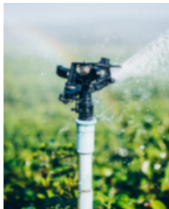
Irrigation and domestic drinking water

By meeting their community's water-related needs, CVWD has helped Coachella Valley become a vibrant hub for families and seasonal visitors. CVWD serves as a multifaceted agency that offers various services: